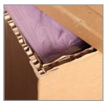
Heavy Duty Packaging