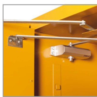
Sequential Self Closing Doors